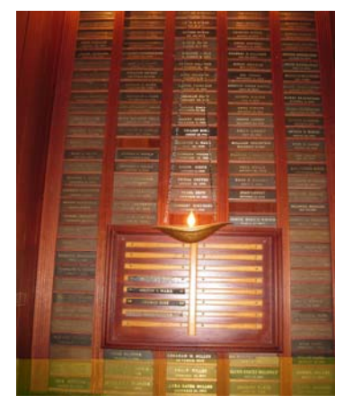
At MRT, loved ones are memorialized with Kaddish at the Shabbat service on or following their Yahrtzeit. If you would like someone's name read on a different Shabbat please contact the office or see the Rabbi just prior to services.

*Indicates that a Memorial Plaque is hanging in the MRT sanctuary ensuring that their yahrtzeit will be observed in perpetuity. Plaques can be purchased by contacting the MRT office. They are hung on the side walls of the sanctuary. Spaces are available on both walls. Cost per plaque is $400.