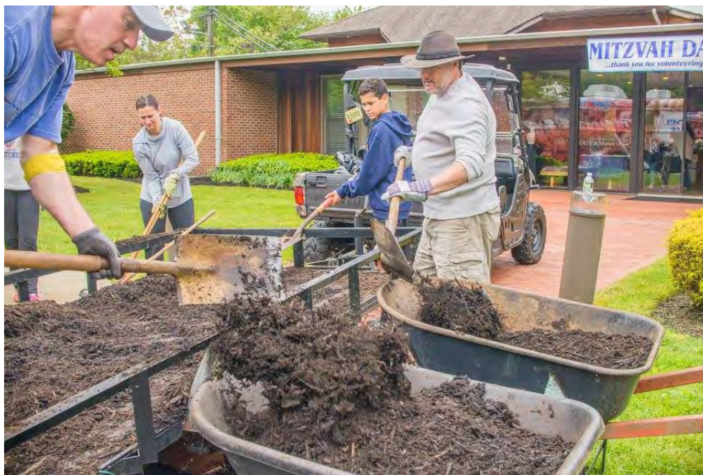
2016 Mitzvah Day Mulching the MRT Lawn