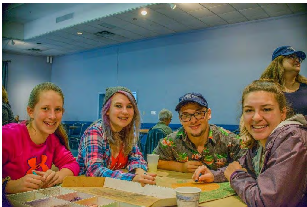
2016 Mitzvah Day Kids