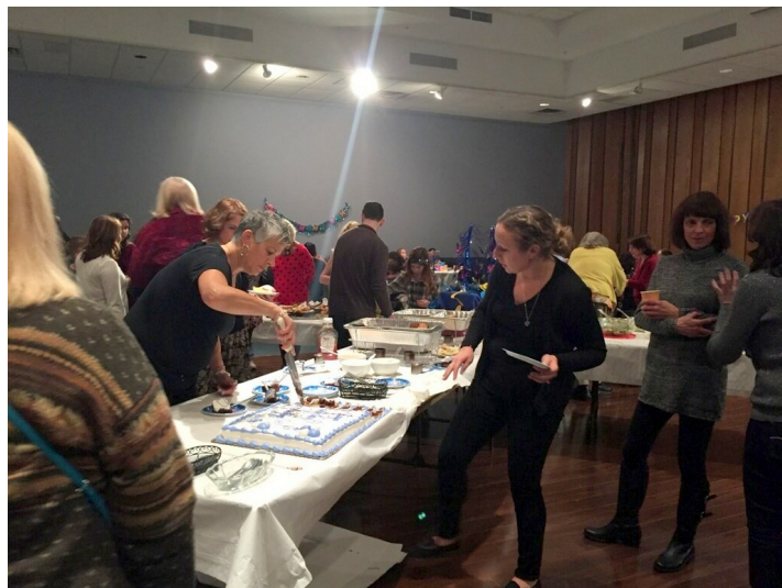
2016 MRT Chanukah Party