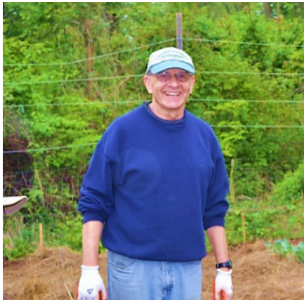
Gan Mazon: MRT'S "Garden of Plenty"