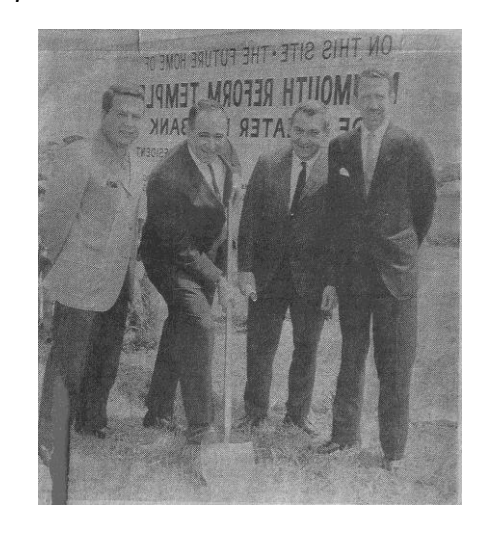
(left) Newspaper clipping from Ground-breaking for the MRT temple building in 1960s.